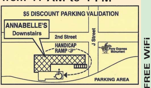
Now Serving Beer &Wine!

Ram Gopal (916) 448-6239 200 "J" Street, Sacramento, CA 95814